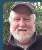
August Krogh Distinguished Lectureship of the APS Comparative and Evolutionary Physiology Section