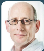
Solomon Berson Distinguished Lectureship of the APS Endocrinology and Metabolism Section