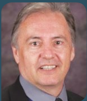
Edward F. Adolph Distinguished Lectureship of the APS Environmental and Exercise Physiology Section