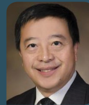
Robert M. Berne Distinguished Lectureship of the APS Cardiovascular Section