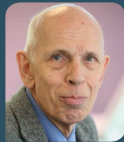
Physiology in Perspective: The Walter B. Cannon Memorial Award Lecture