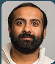
Henry Pickering Bowditch Memorial Award