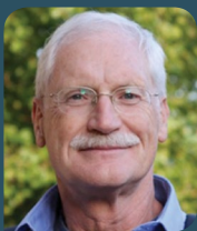
Joseph Erlanger Distinguished Lectureship of the APS Central Nervous System Section