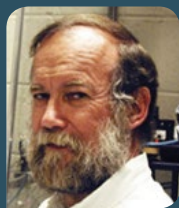
Hugh Davson Distinguished Lectureship of the APS Cell and Molecular Physiology Section